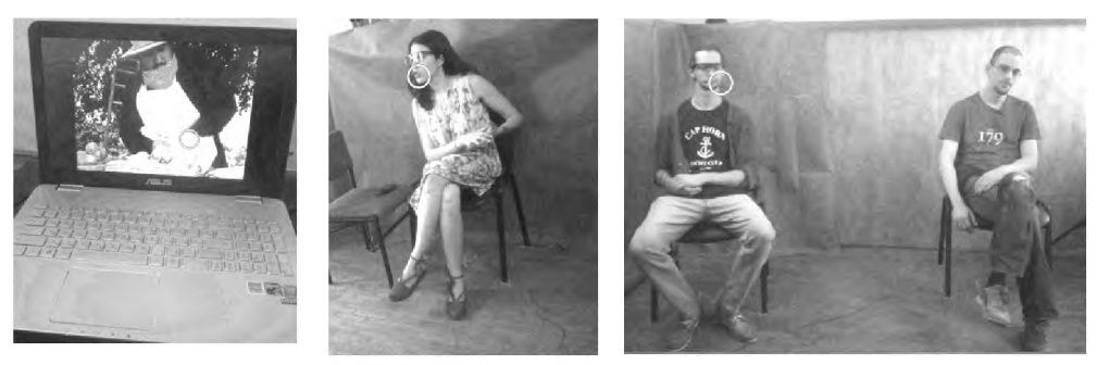
a. Viewing the Pear film b. From the N's eye-tracker c. From the R's eye-tracker